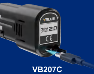
VB207C Type-C Rechargeable Battery